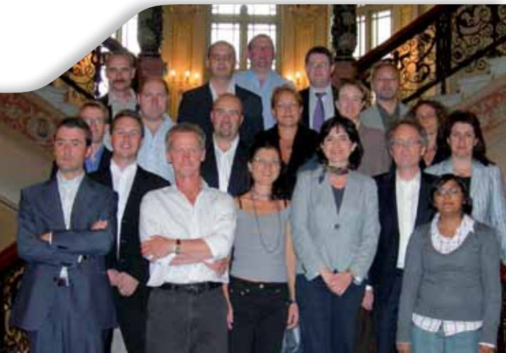
Building partnership within the PIKE project

(South West of England Regional Development Agency, Lead partner of RAPIDE)